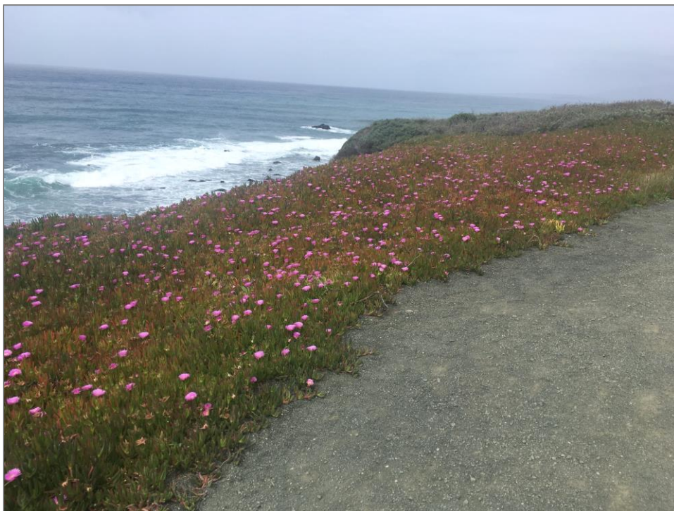
This is ice plant from South Africa.

Fact: Native sea cliff buckwheat supports more than thirty types of butterflies and moths.