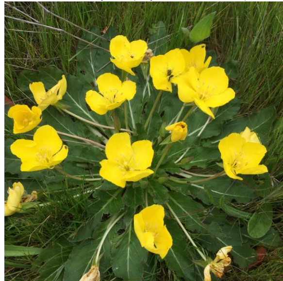
Sun cup ( Taraxia ovata )