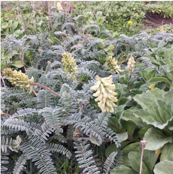
Ocean bluff milk vetch ( Astragalus nuttallii )