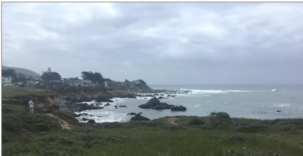
Otter Cove at high tide (seaweed hard to see).