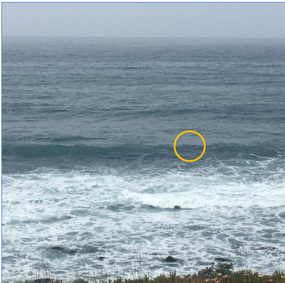
Otter in orange circle riding the crest of the wave.

Fact: Sea otters spend all their time in the ocean, even when they are sleeping.