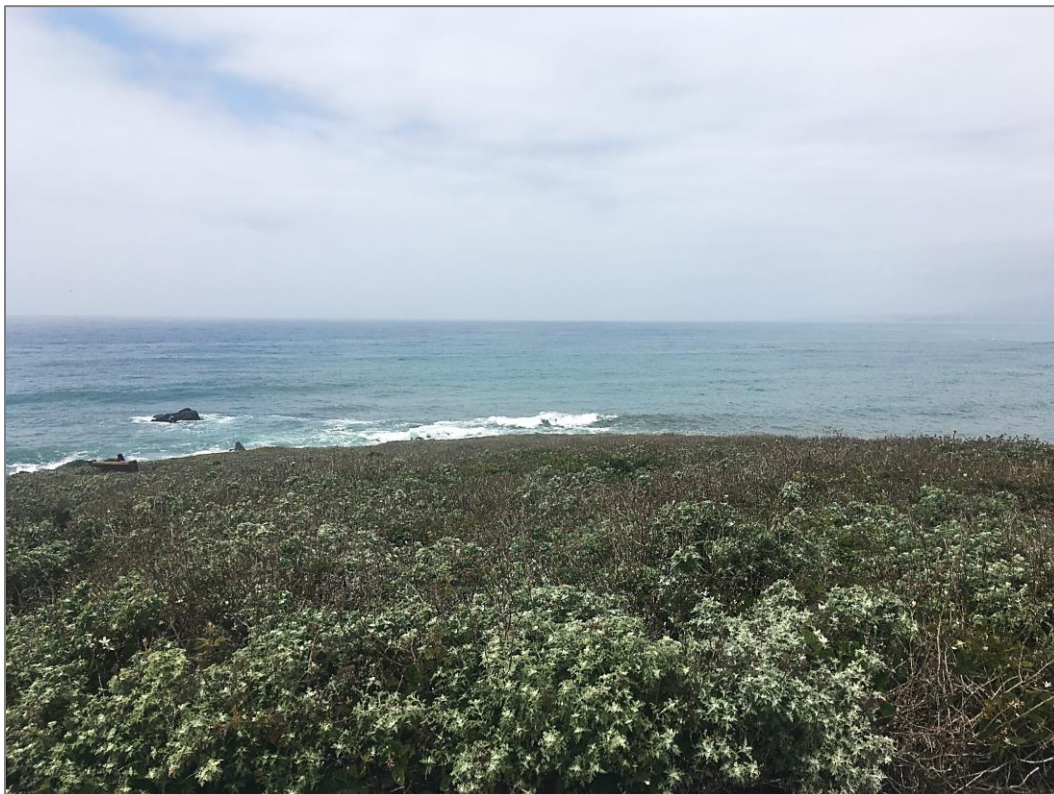
The marine sanctuary runs 275 miles up the coast past San Francisco.

Fact: Fish numbers, size, and diversity are two to five times higher in marine protected areas.