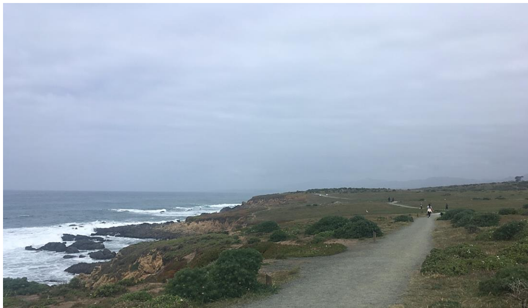
Looking north toward Big Sur on a cloudy day.

Fact: From this point, you can see about 6 miles out to the horizon. Further up hill, you will be able to see farther.