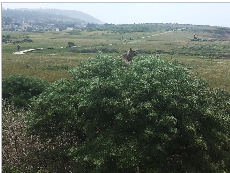
A ground squirrel on a bush lupine.