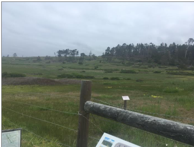
Looking uphill to the Monterey pine forest.