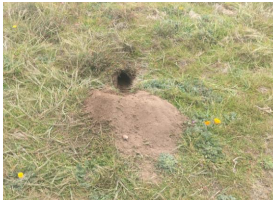
Ground squirrel burrows.