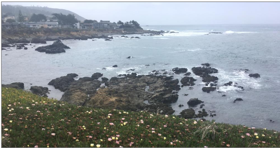
Rock shelf in Otter Cove where harbor seals often haul out.

Fact: Harbor seals grow from 25 pounds at birth to around 250 pounds when fully grown.