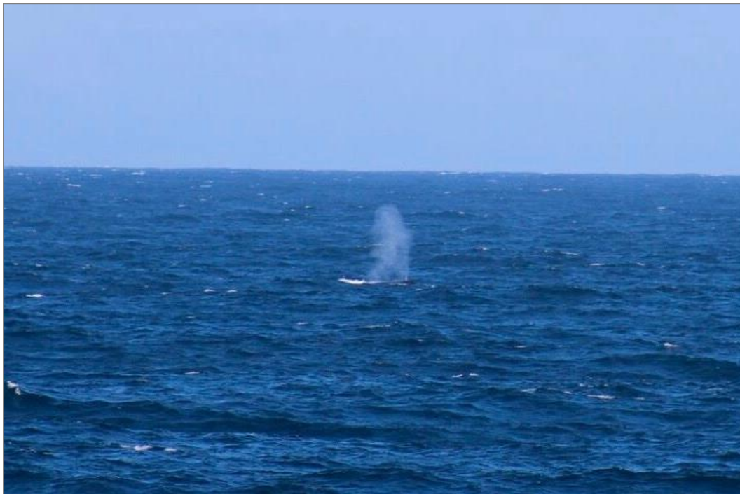
Whale spouting water into the air.

Fact: Whales exhale 90% of their lung capacity with each breathe. Humans exhale 15%.