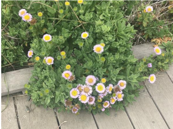
Seaside daisy ( Erigeron glaucus )