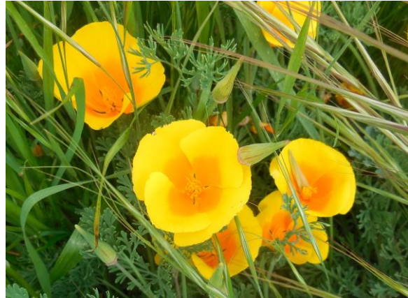
California poppy ( Eschscholzia californica )