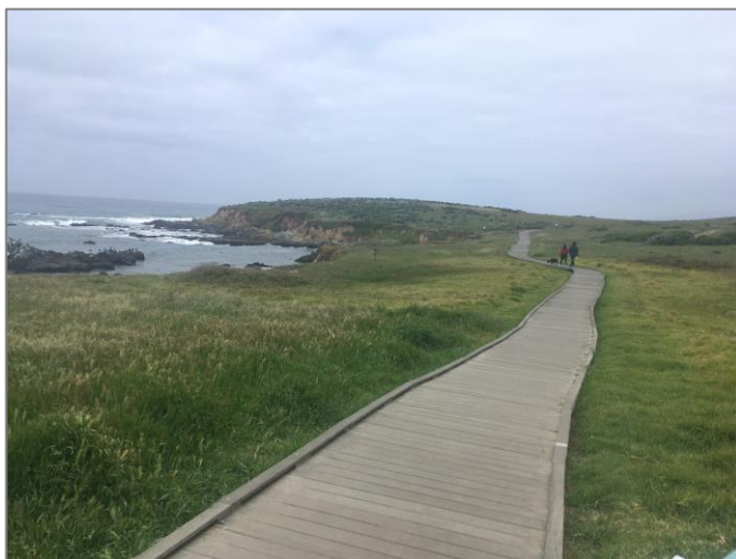
Looking along the Bluff Trail.