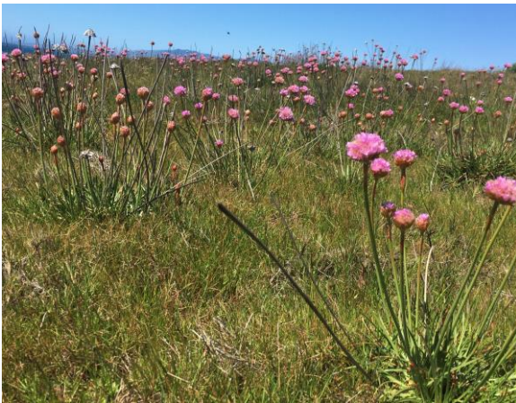
Sea pinks ( Armeria maritima )