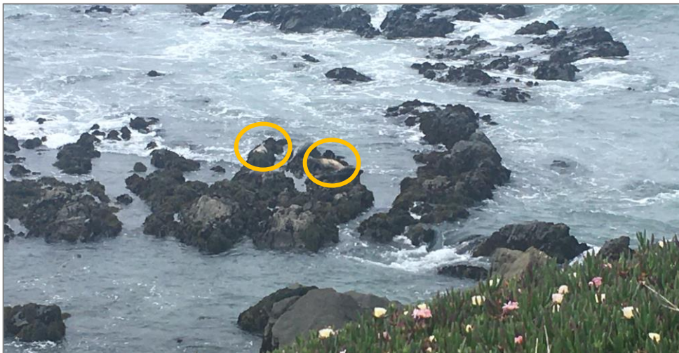
Two harbor seals on rocks in Otter Cove.